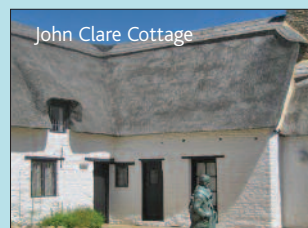
John Clare Cottage

John Clare Cottage has been given £5,000. Amongst other activities the John Clare Trust round a year round programme of educational activities to help children gain an appreciation of the environment and nature which inspired the poetry of John Clare.