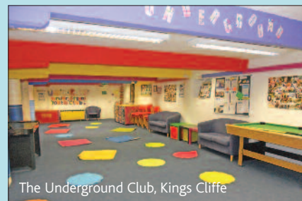
The Underground Club, Kings Cliffe