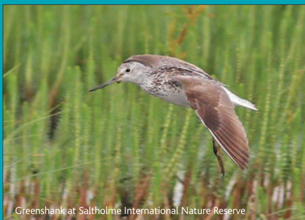
Greenshank at Saltholme International Nature Reserve

The landfill site at Port Clarence contributes through the Teeside Environmental Trust to the Saltholme International Nature Reserve which is run by the RSPB. A state of the art visitor centre was opened in 2009 which provides an important facility for educational visits as well as community use. Three architect-designed hides have been incorporated into the site which are designed to bring visitors as close as possible to the wildlife. To find out more or to visit the site please go to www.rspb.org.uk