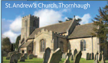
St. Andrew's Church, Thornhaugh