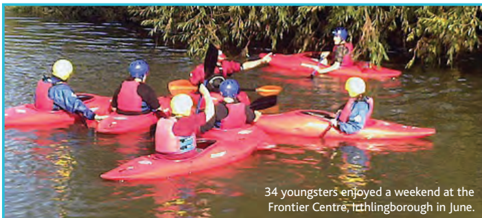
34 youngsters enjoyed a weekend at the Frontier Centre, Irthlingborough in June.

The two youth clubs continue to be a huge success with large numbers attending and the drop-in on a Friday night for 15 -18 year olds is building up well with some local bands being invited to showcase their talents.