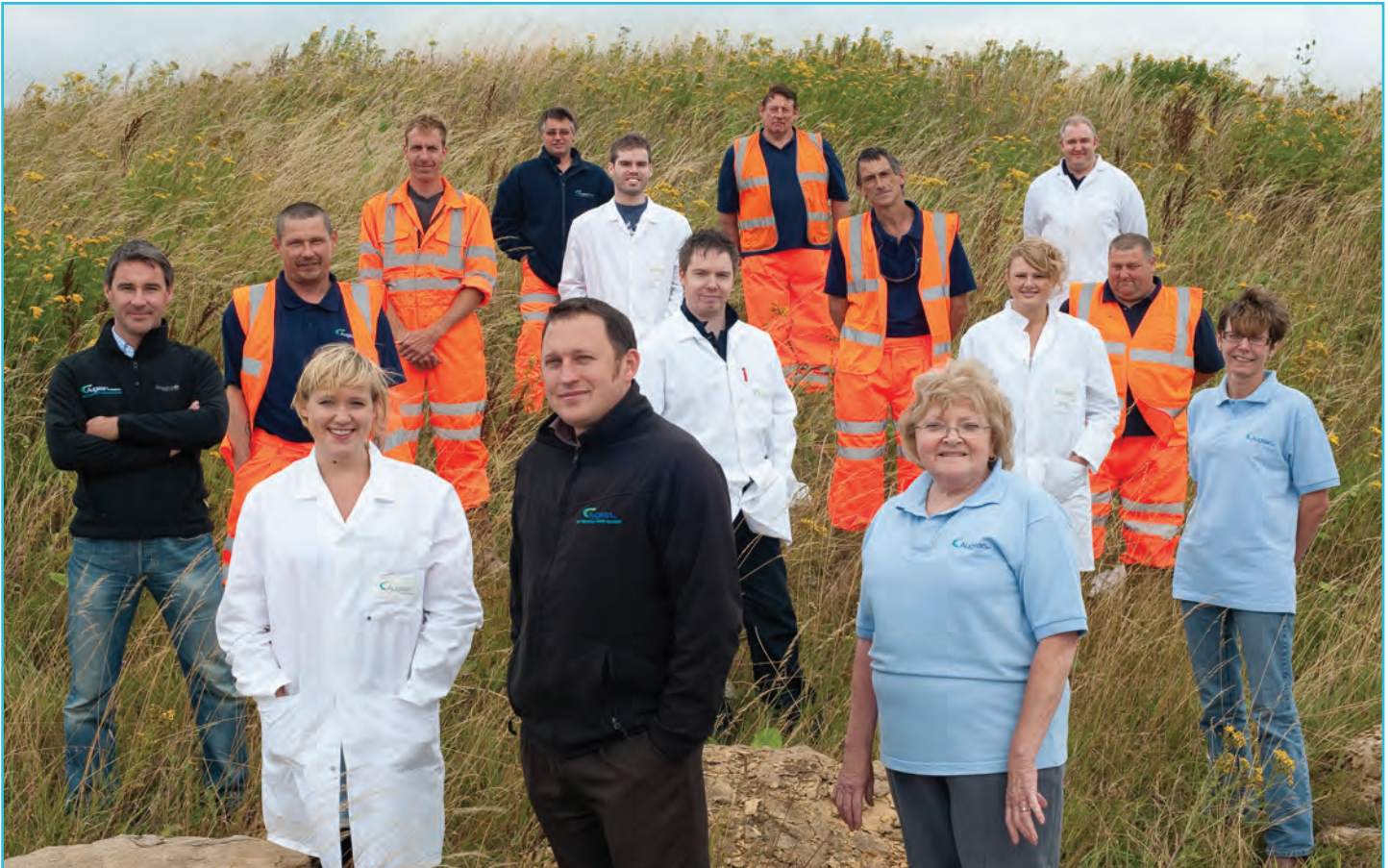
The staff based at ENRMF are highly trained and include seven with university degrees and several higher degrees.