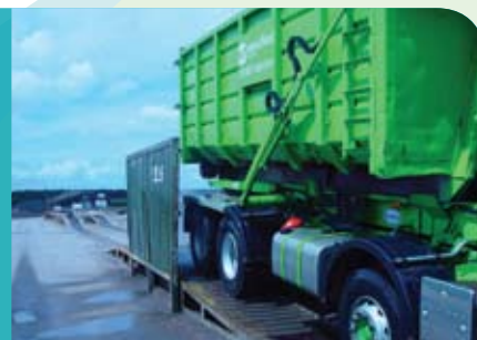
A lorry completes wheel washing before leaving the site