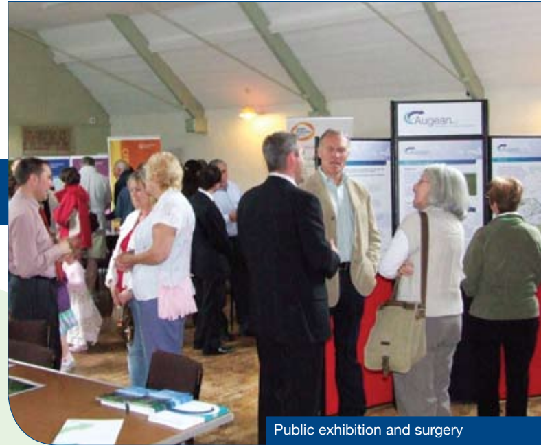
Public exhibition and surgery

A large number of questions and issues were raised at the public exhibition and in subsequent meetings.