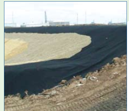
A typical hazardous landfill cell lining under construction

The safety of the transport of materials with a radioactive content is governed by UK dangerous goods transport regulations. These require the wastes to be contained in packages appropriate for the level of radioactivity. The number of vehicle movements and the environmental impact of transport are not increased by this application.